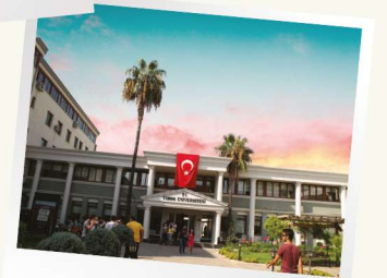
45 Evler Campus

Adress: Bahçelievler Kampüsü, 1857 Sokak, No:12, 33140 Yenişehir/Mersin, Türkiye Phone: 0324 325 33 00 / 0530 290 9695 Mail: info@toros.edu.tr